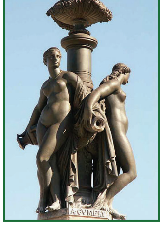
Trois Grâces , Gumery, Bordeaux.

The Trois Grâces , also known as « La Danse», are a half size composition of the three main bacchants from the high relief carved by Carpeaux for the Opera Garnier's front. The group caused a scandal in 1869, by its licentious gesture. The three bacchants, bearing crowns of ivy, laurels and roses are dancing in a circular way with a flemish atmosphere which contrasts with the Grace and perfection which made it renown from the artist lifetime and as an iconic model in the Sculpture History. Except this pleasant aspect, this composition has a balance dynamism, as a French characteristic remaining in the sculptor's œuvre.