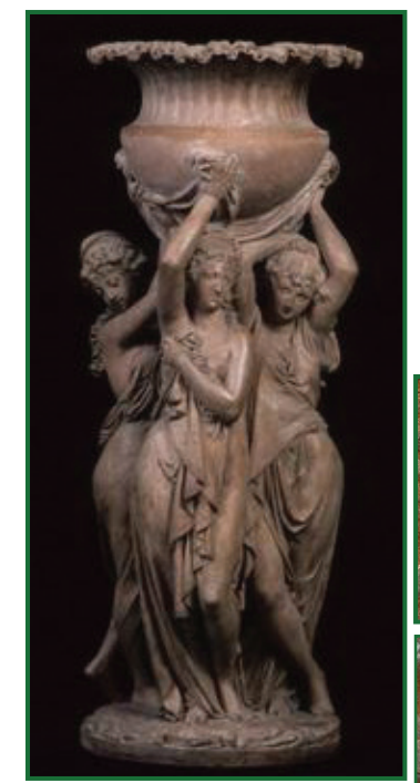
Trois Grâces , Carrier Belleuse, Santa Barbara Museum of Art

This arrangement, close to the one of the Fontaine de l'Observatoire set in 1874, was not mainly produced during the artist's lifetime or even after his death. Probably, the cost of marble, the complexity of moulding for bronze cast or terra cotta kilning led the studio to give it up quickly.